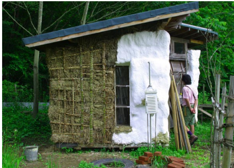
Partly constructed “strawbale” experimental building at Permaculture Centre Japan garden site

Permaculture design requires that we study and understand the sustainable traditions of the local region, recognise the limits or weaknesses in those traditions for current conditions, identify solutions from traditions in similar climates as well as the special opportunities to reduce and recycle wastes created by affluent, high-energy society.