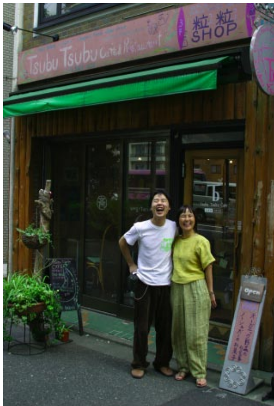
Tsubu-tsubu cuisine: Soba (buckwheat noodles), millet and sorghum fried dishes, wild vegetables and pickles.

In Australia, especially South Australia, seasonal and bioregional food design is creating new gastronomic culture by blending relevant migrant food cultures 9 but most of this work focuses on animal protein, vegetables and fruits rather than grains. Tsubu-tsubu food is solidly grounded in traditional sustainable Japanese culture 10 but involves a deep creative redesign of how to use the diverse culinary potential of these neglected grains which themselves have been the basis of many food cultures around the world. The diversity of textures and tastes from such simple ingredients was astonishing. The results were certainly very attractive to our senses and showed us ways of expanding our previously limited use of grains we already grow (buckwheat) or others that may be suited (millet).