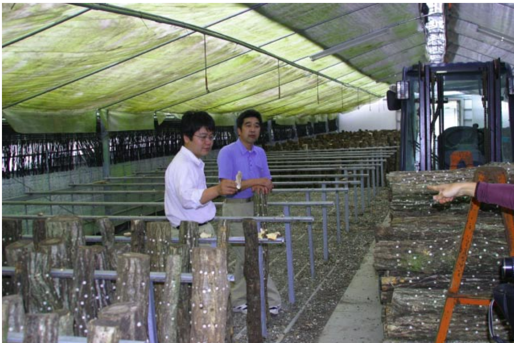
Commercial shitake mushroom production using inoculated oak billets from local forests in Miyasaki

In the heart of large scale timber production country in mountains behind Miyasaki, we saw cable logging of deciduous oak forest as well as softwood plantations at various ages up to 120 years old. In all cases, the size of coupes and proportion of the landscape harvested was small. Like many eucalypt forests in Australia, only a limited proportion of oak is good enough for sawlogs. While woodchips (much of it exported to Japan) is the major use of lower quality hardwoods in Australia, oak limb wood is used in very large quantities for growing shitake (the most popular Japanese mushroom) as well as charcoal, widely used as both a smokeless fuel and for water and air filtering.