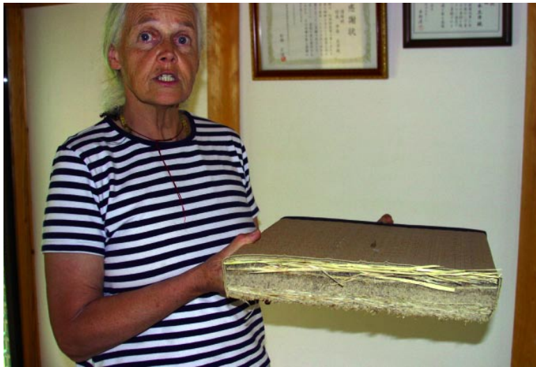
Tatami floor mats sample cross section typical of those widely used in Japan with recycling potential as wall insulation

The traditional post and beam construction could be set to the standard tatami module with an external wall cladding of timber vertical boards over a sarking. Horizontal bamboo spacers could be used to separate either 1 or 2 “retired tatami” insulation panels from the cladding and the lining. Further horizontal bamboo strips provide keying for an inside rendered earth/straw or lime mixture up to 50 mm thick and flush with the timber frame. This traditional (exterior) lathe and plaster (or wattle & daub) system would provide the thermal mass necessary to store some of the heat from appropriately sited, south facing windows. In less wet areas or under large eaves, good quality earth render over bamboo lath and plaster could be used as the exterior wall surface instead of timber.