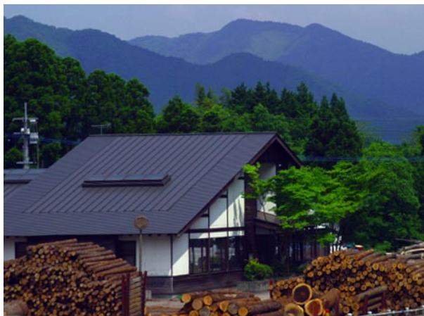
Above: Small sawmill in mountains of Kyushu with stock of Sugi posts and sawlogs