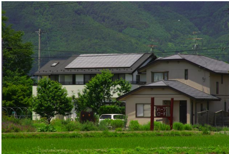
Photo voltaic grid feedback electric power array on rural house in Nagano prefecture

the same resources on higher yielding renewable sources such as micro-hydro power, forest biomass or even wind. Better still the same resources spent in saving energy [conservation] is the most profitable of all “new energy” sources, so called negawatts 18 .