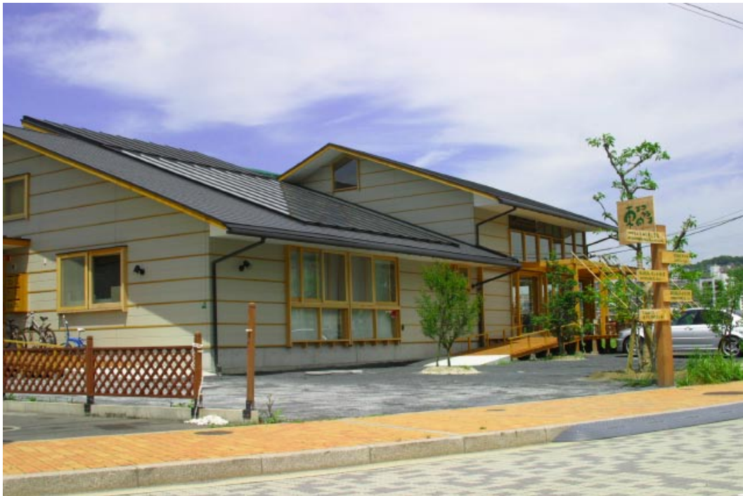
Recently constructed ecological office building Kitikyushu with simplified “OM Solar” roof mounted active air collector supplying thermal mass storage for heating and cooling.

In recent years, straw-bale has become popular (in ecological building networks in the USA and other countries) as a high insulation, cheap renewable material for house wall construction. While some of my most respected colleagues have been pioneers in developing straw-bale building, I have long been a straw-bale sceptic. Although I recognise it is an appropriate material in some climates and bioregions, in others it is more problematic. The problems from over enthusiastic adoption of ecological fashions are as great as those from conservative resistance to innovation. My observations of Japanese experiments in straw-bale building suggest my scepticism is particularly appropriate to restate.