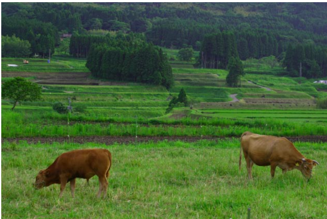
Beef cattle grazing in the Aso region, a rare site in most of Japan. (Local breed of cow specific to region)

The use of animals to control weeds and pests, while fertilising and cultivating the soil, is an agricultural example of the permaculture design principle “Integrate rather than segregate”. In the process of providing ecological services and replacing non-renewable inputs, domestic animals can be allowed to express their true nature rather than being confined in artificial and inhumane conditions. The classic example promoted in permaculture teaching is the chicken tractor in which hens are used in rotation with annual vegetable and/or grain crops to eat weeds and crop wastes and prepare ground for the next crop.