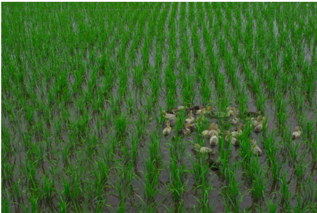
Aigamo ducks controlling weeds and pests and providing manure in rice paddy on organic Teikei farm in Chiba prefecture

Despite this history of segregation of animals from cropping in Japanese traditional and industrial agriculture, and difficulty in adopting permaculture examples of integration from Australia, the rice/duck farming system that we saw at several organic farms in Japan is one of the best examples of integration of animals with annual cropping. Unlike the chicken tractor systems which involve a sequential rotation of birds and crops, the ducklings in the rice paddies forage weeds and pests during the growth of the crop. This requires precision in the breeding and rearing of ducklings, protection from predators, supplementary feeding, and culling of mature birds for meat. Takao Furuno 4 suggested (when we visited) that the system has not spread as far in Japan as in south east Asia and China because the Japanese don't eat much duck. I can also see that there are fewer reasons for Japanese farmers to adopt simple low tech solutions than there are for farmers in poorer Asian countries without the structure of subsidies for agriculture that Japanese farmers receive (directly or indirectly)