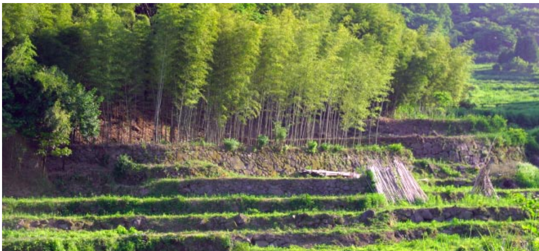
Satoyama project site near Nara recovering rice growing terraces from invading Moso bamboo and restoring coppice management in oak forest

We visited three Satoyama projects in different parts of Honshu. All involved volunteers working on private land restoring ecological and traditional productive values, mostly by cutting vegetation and in some cases by supplementary planting as well as restoration and maintenance of water management structures and rice paddies. Clearing bamboo forest from rice paddy terraces, thinning conifer plantations and patch felling oak forest to make charcoal and grow shitake mushroom might not sound like environmental restoration, to Australians, but they certainly are to the Japanese. That human management is not a part of nature is a modern environmental idea that appears to have made little impression on Japanese attitudes to their forests.