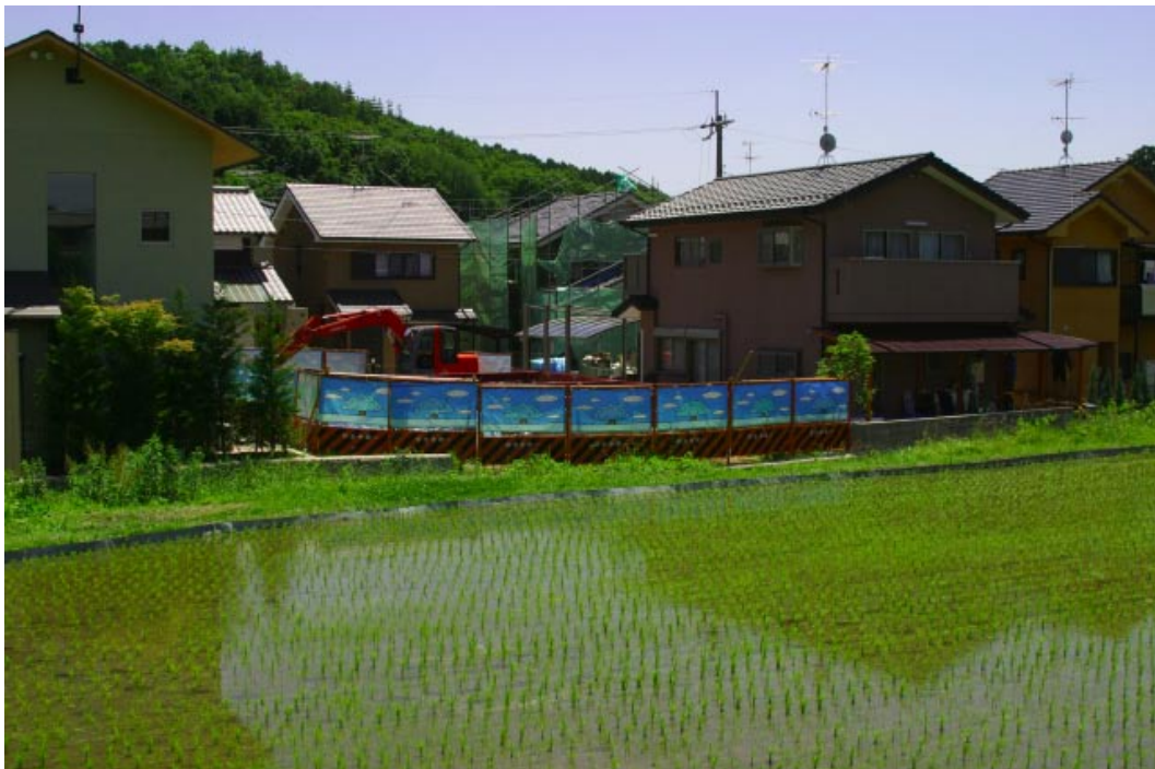
Rice paddy within Kyoto residential suburb with new house construction on ex food producing field.

In Australia, interest in CSA's, box marketing and farmers markets is growing rapidly while in the USA there is over 1000 CSA's. The Americans got the idea from Japan. What struck me about the Teikei farmers we visited was their expertise in growing such a diversity of produce (40-70 varieties) and how they see that diversity as a measure of their success because the demand from customers is for as much variety (within seasonal limits) as