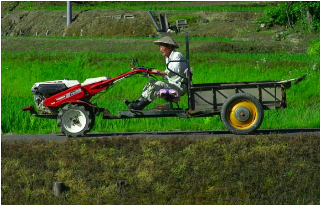
Elderly farmer heading to work (with brush cutter in trailer) along bitumen sealed access tracks between rice paddies.

Excellent sealed roads, power, telephone and postal services are available in all but the most remote and rugged mountain settlement. Central government funding of rural infrastructure, agriculture and community facilities provide an extraordinary high standard of living in the villages but this has not been enough to stop the drift to the city. Current government policies to reduce support for agriculture and increase average farm size from an incredibly small 1.5ha to 20ha over the next decade threaten to accelerate the depopulation of rural Japan. From an Australian perspective, rural Japan offers a sense of space missing in the city (especially in larger traditional farm houses), close connection (often within 100 metres) to wild mountain forests and streams of stunning beauty, unimaginable soil fertility and abundance of water, combined with a level of transport, communication and community facilities that rural Australians can only dream of.