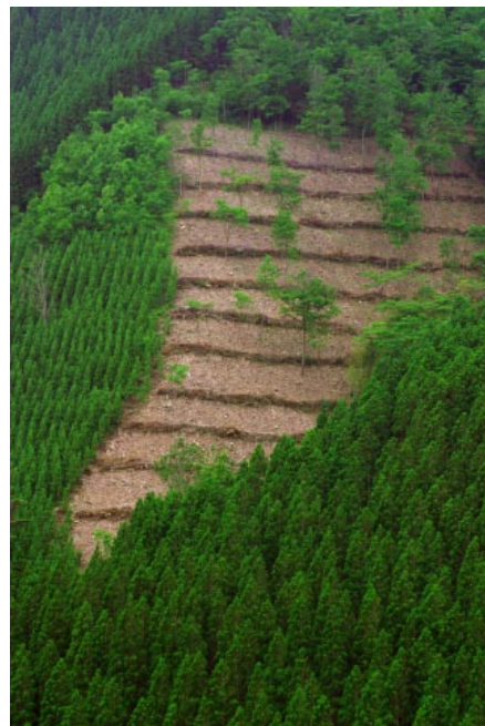
Right: Sugi logging coupe on very steep country with retained deciduous trees and slash laid on contour to prevent erosion

Sustainable nature-based forestry around the world provides some of the best examples of permaculture principles. One of my main interests for the trip was to see Japanese forestry. For decades I had been aware that Japan had managed to maintain a balance between timber production and watershed protection in its predominantly mountain