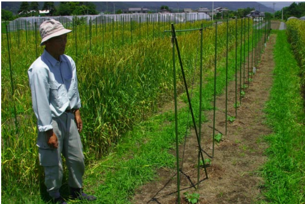
Vegetable seed selection trial plots for commercial production using natural farming methods at Research centre in Nagano prefecture [green manure intercrops cut for mulch]

The main field trials shown to us consisted of neat long rows of crops between strips of winter grains, and other green manure crops which were cut as mulch. Although there was no deep cultivation, surface tilling was used to create seed beds and allow the plants to become established before mulching. It didn't look like the image of natural farming conveyed by Fukuoka's books. In another smaller trial area, seeds and fruit from vegetable varieties were scattered into weed stands, which were cut once the seed germinated. Intense competition allowed the strongest plants to dominate which were then thinned to breed varieties able to cope with competition. This looked more like Fukuoka's methods.