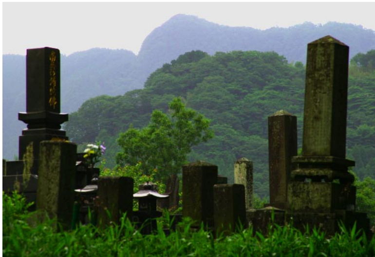
Cemetery behind houses on land owned by the same families for centuries in Aso region Kyushu. A common sight throughout Japan

Young urbanites without connections wanting to return to the land often rent run down houses and (typically separated) small fields for growing vegetables and maybe a rice paddy that has been neglected. Large numbers of older and affluent Japanese are also making the reconnection to nature and traditional culture through rural tourism, craft classes and other activities after a lifetime of city work. A more limited number, disillusioned with mainstream values and society, are moving to rural areas, in part to escape the consumer madness of their peers and children.